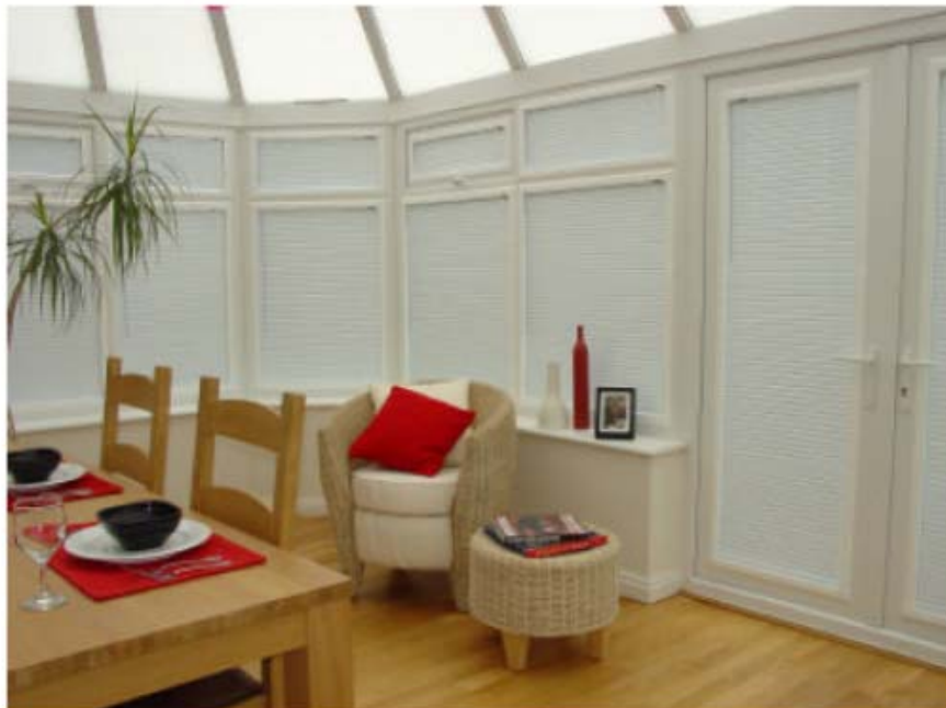
Perfect Fit with Venetian Blinds